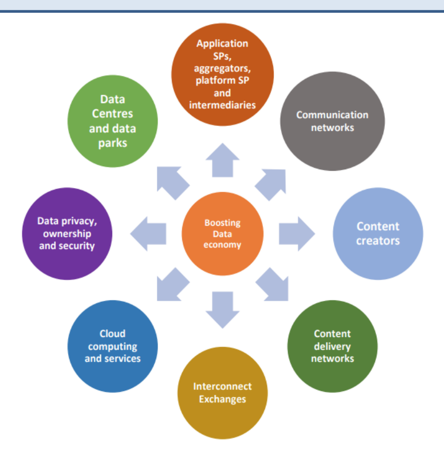
Boosting data economy

TRAI has issued Recommendations on 'Regulatory Framework for Promoting Data Economy Through Establishment of Data Centres (DCs), Content Delivery Networks (CDNs), and Interconnect Exchanges (IXPs) in India' dated 18<sup>th</sup> November 2022.