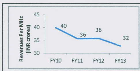
Chart 2: CDMA Revenue/MHz (INR crores)