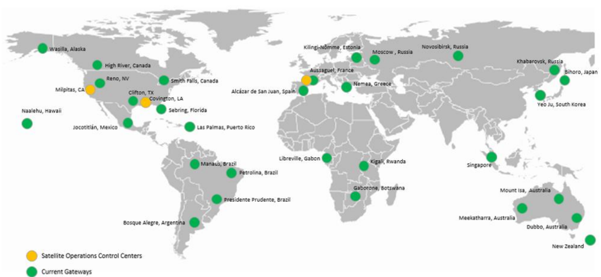
Figure 3. Globalstar Gateway Ground Stations