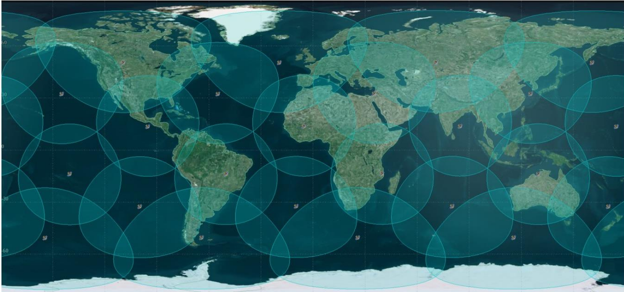
Figure 1. Globalstar's satellite constellation

Originally licensed by the FCC in 1995, Globalstar's second-generation constellation ("HIBLEO-X") was deployed by Globalstar and notified to the ITU by the French Administration in 2010. Using a transparent transponder architecture, Globalstar satellites apply proven technology to provide global coverage communications, providing fast switching and ensuring low latencies for voice and data communications.