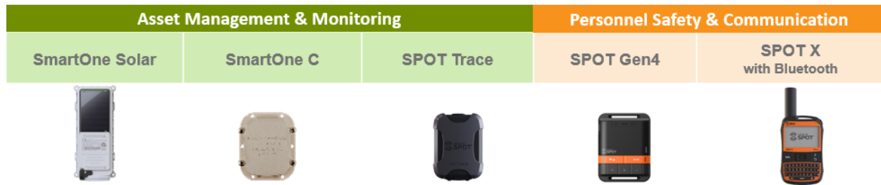
Figure 5. Globalstar Product Line

Overall, Globalstar has distinguished itself for more than 20 years as the only operator in the consumer-centric satellite segment, providing essential services to hundreds of thousands of individuals and businesses.