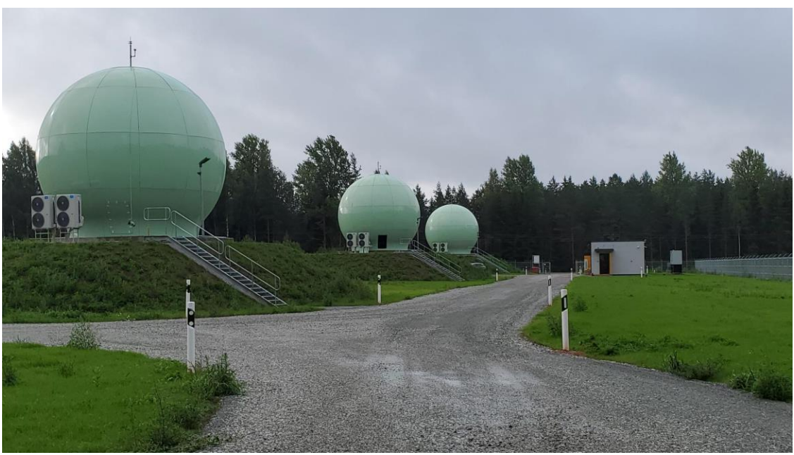
Figure 4 Kilingi- Nõmme, Estonia Gateway