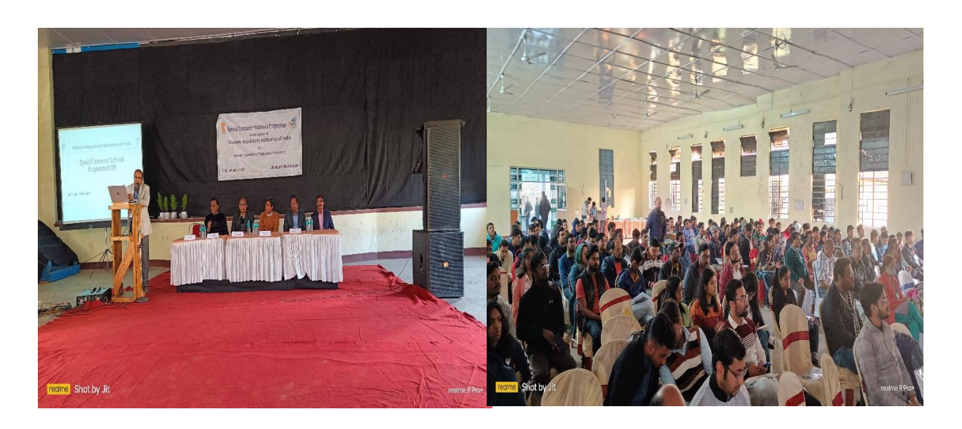
Special Consumer Outreach Program for students at Jalpaiguri (West Bengal) held on 21st January 23 by Regional Office, Kolkata