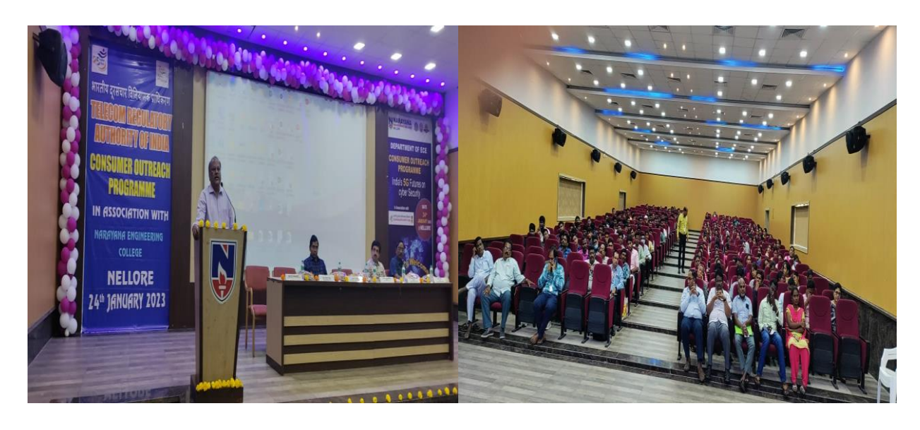
Special Consumer Outreach Program for students at Nellore (Andhra Pradesh) held on 24<sup>th</sup> January 23 by Regional Office, Hyderabad