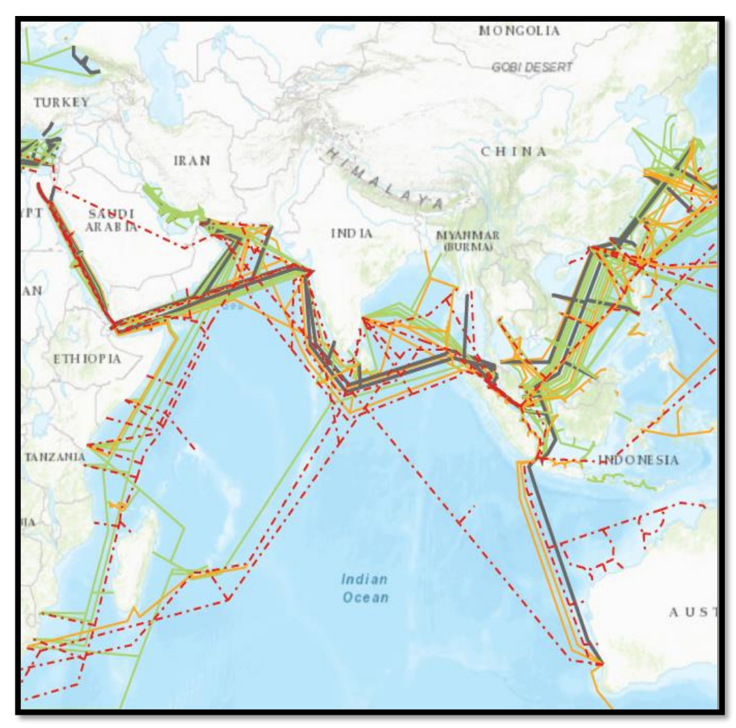
Submarine Cables around Indian Subcontinent <sup>6</sup>

2.1 As of now, India has total 17 SMCs landing at the Cable Landing Stations (CLS) near the coastline to connect with the terrestrial network. Mumbai and Chennai have the maximum concentration of SMCs. Also, number of new SMCs that are under planning/construction, are going to make a landfall at the different coastal cities of the country including some new locations in India.